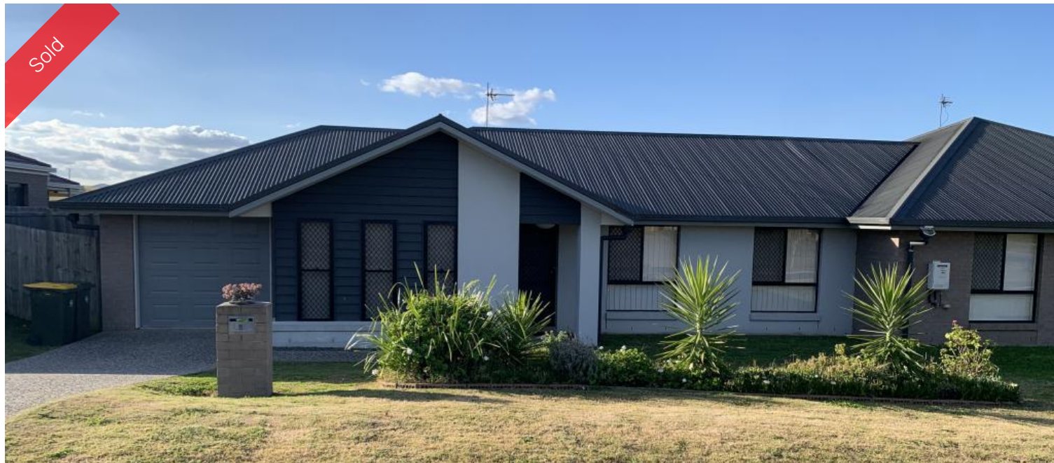
Unit 1, 2 Sharon Dr, Rosenthal Heights